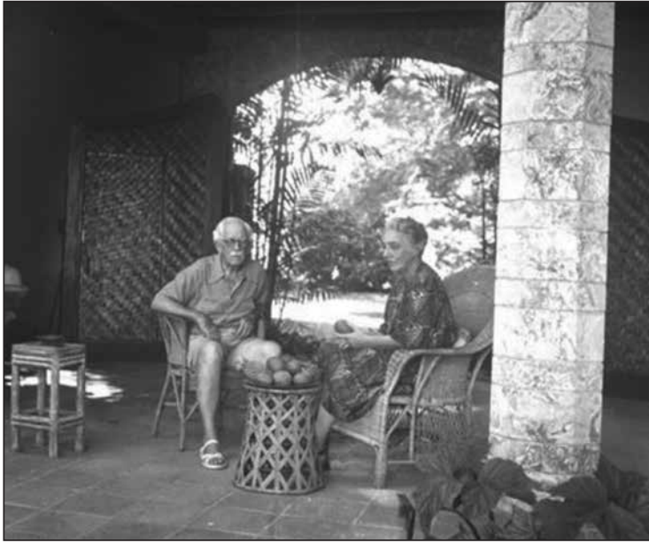
Fig. 1. Dr. Fairchild with Marian Bell Fairchild enjoying mangos that he helped introduce into Florida at their home, The Kampong.

new year of 1897, while traveling together on the boat, Dr. Fairchild had promised Mr. Lathrop that he would take up studying plants useful to man, and with his help would work on introducing their culture to the U.S. Thus began Dr. Fairchild's long and distinguished career of plant introduction and exchange.